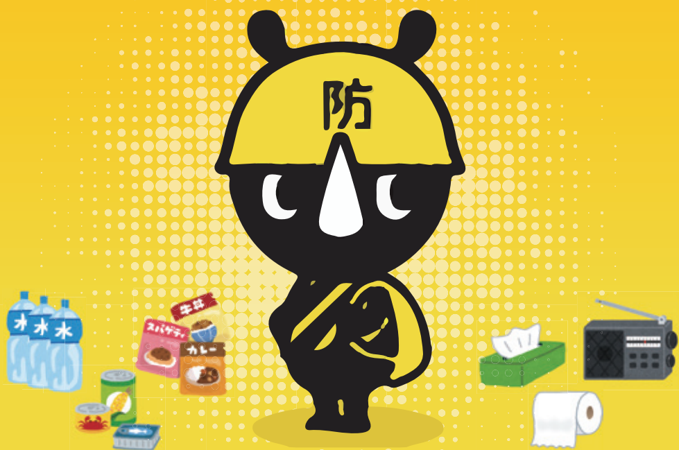
Bosai the Rhino Official “Disaster Preparedness Tokyo” Character

- To Allow You to Remain Living at Home After a Disaster -